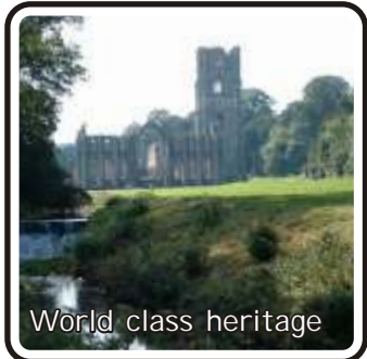
World class heritage

Pick up a 'Caring for NIDDERDALE AONB' card