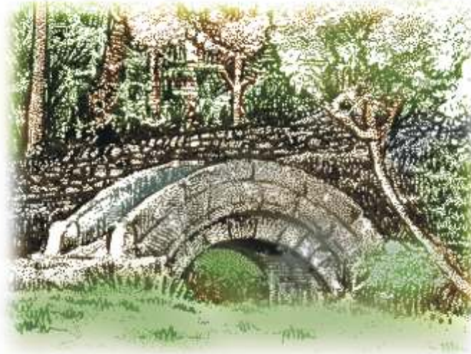
The packhorse bridge

The lower left-hand wall above Padside Beck marked the boundary of the Forest of Knaresborough.