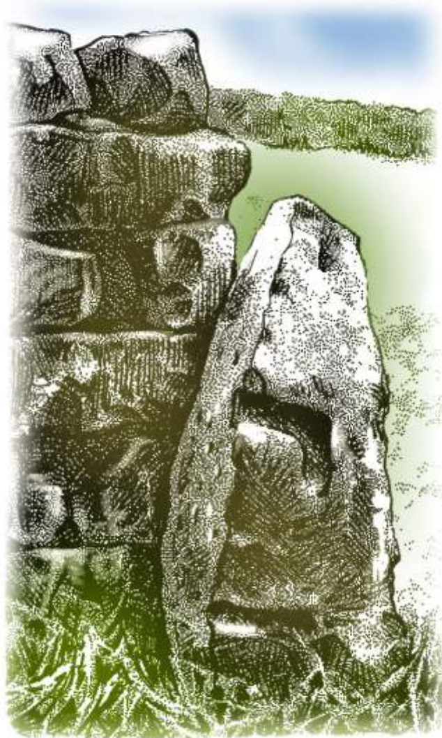
Remains of stang stoop

After entering the third field, turn right over the low stone wall and walk over the footbridge and through the stoop or squeeze stile.