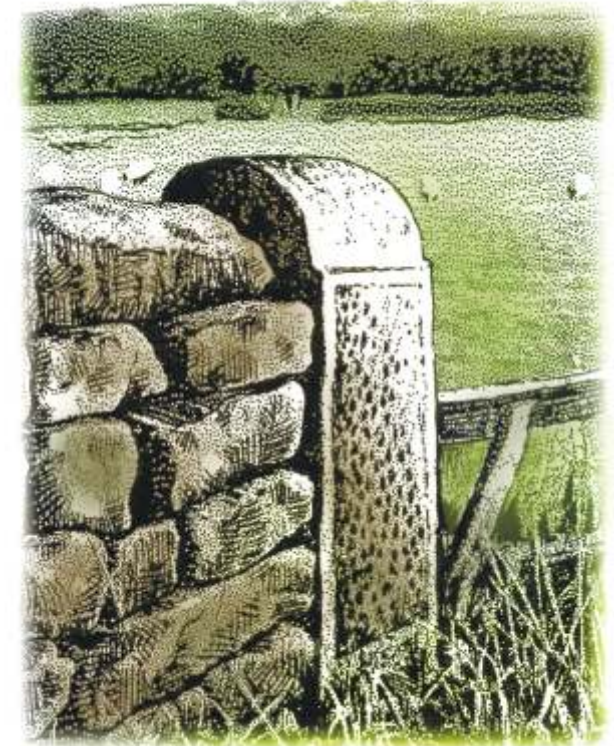
Dressed stone gate post

The walk next passes through a large field, which often contains cattle including bulls. These will be of breeds allowed to share the field with you and are not likely to have any great interest in your presence. However, if you prefer, you may bypass the field by continuing along the road and turning left down the next road.