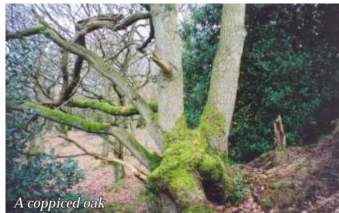
A coppiced oak

Holly was harvested as a fodder crop and stored to feed animals during the winter. Oak bark was used in tanning hides and there was a tannery at Braisty Woods Farm. After the Dissolution of Fountains Abbey more of the woodland was cleared to create fields for agriculture.