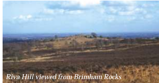
Riva Hill viewed from Brimham Rocks

To help you stay on the right track the Hartwith Heritage Walk has its very own waymarker signs. Keep a lookout for them along the route.