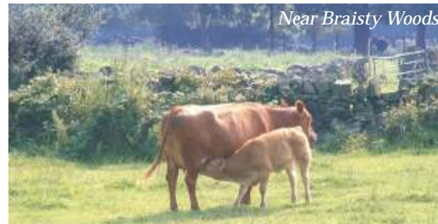
Near Braisty Woods