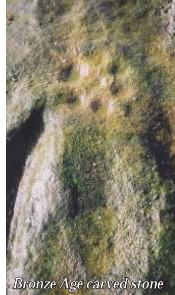
Bronze Age carved stone

Remains of a very early settlement can be seen in Old Spring Wood. It is believed that they date from Iron Age times, 600BC-70AD. Quernstones of a beehive shape formed from the local sandstone have also been found in the area.