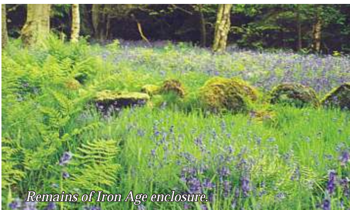
Remains of Iron Age enclosure.

More recently there were several small quarries on the hillside above Summerbridge, the stone most likely used to build new enclosures in the second half of the 19th century.