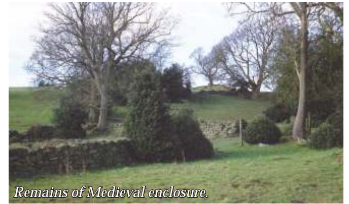
Remains of Medieval enclosure.

In 1132 the Cistercians were granted land to build Fountains Abbey a few miles from here and in 1135 Lord Mowbray granted them lands in Nidderdale, including Hartwith. Fountains Estate was initially farmed "in house" by Lay Brothers, and an expansion of husbandry and woodland management was encouraged. Lodges (farms) and Granges (somewhat larger administrative centres with farms) were established. They often specialised in cattle and sheep rearing and even fish farming using water from the Lurk Beck. By the 14th century, much of the estate had been leased out to tenant farmers, though the woods were retained by the Monks. Brimham Lodge and the Park remained under the control of the Abbot.