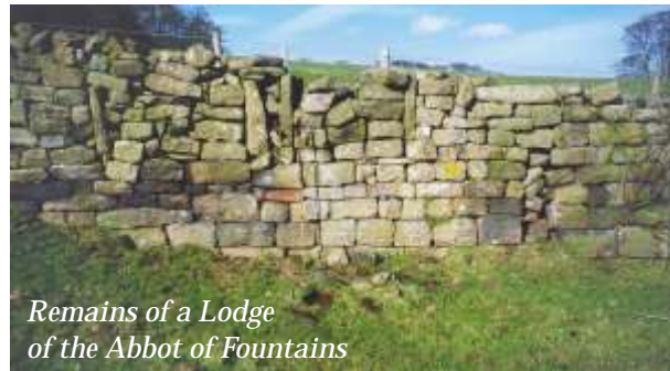
Remains of a Lodge of the Abbot of Fountains